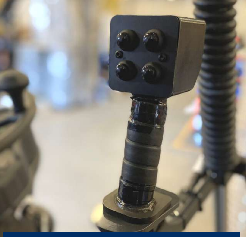
Two-position hydraulicassist system